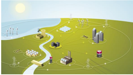
Figure 3: JRC-IET Smart Grid Education Tool