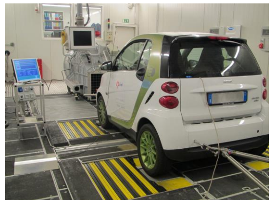
Figure 2: JRC-IET Vehicle Emissions Laboratory (VeLA)

The Ispra location of JRC-IET is recognized for testing vehicles and engine emissions in its VeLA-labs; this will be the site for EV efficiency and performance testing as well as evaluating EV-EVSE compatibility and, from 2014 onward, electromagnetic compatibility (EMC, both emissions and immunity) (Figure 2). The Petten location is expanding its Fuel Cell Test Facility to test EV batteries and the Smart Grid Simulation Centre to evaluate EV-grid interactions (e.g., the smart grid education tool shown in Figure 3).