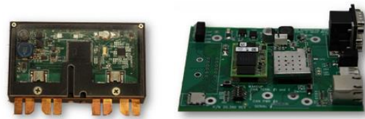
Figure 5: End-Use Measurement Device (EUMD) and Electric Vehicle Communication Controller (EVCC)

Argonne has also developed a communication controller to evaluate power line communication (PLC) technologies that enable messaging between EVs, EVSE and the grid (Figure 5). The controllers are being used in AC and DC charging communication development (shown previously in Figure 3) and as the basis for developing a gateway to bridge existing utility messaging infrastructure (SEP 1.1) to SEP 2.0 [4].