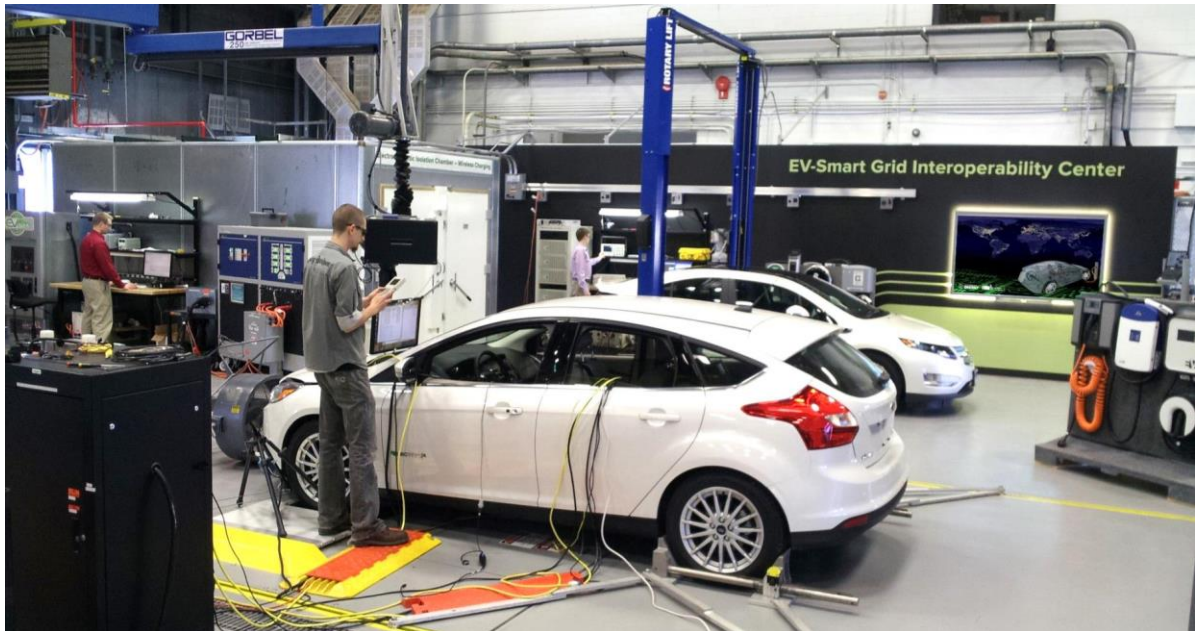
Figure 1: Vehicle connectivity and charging communication development at ANL