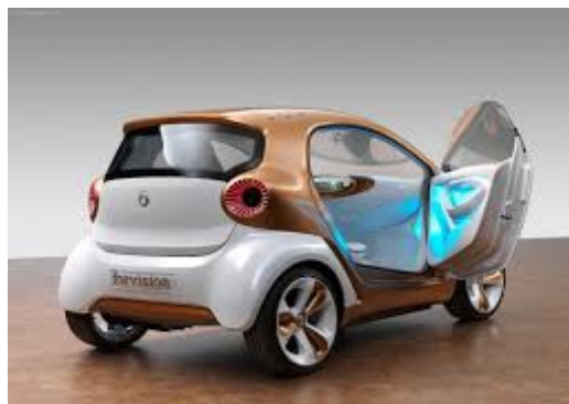
Figure 2: The Mercedes Smart Forvision

original concept with the launch of the all-electric E-Smart and the Smart Forvision.