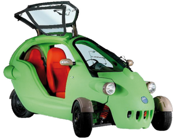
Figure 3: The SAME EV (www.Cree.ch)

It is also important to note that many innovative players in the Microcar space have faced problems surviving in the recent challenging economy, including Aptera, Elettrica, Reva, Tzero, Think, Tango and more.