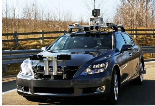
Figure 4: The Google Autonomous Vehicle

The idea of driverless vehicles has long been a staple of science fiction, but real-world demonstration of the technology dates back to the 1939 New York World Fair where General Motors showed their Futurama exhibit where vehicles interacted with the highway. ARVs have also been a hot topic since the 1980s but were given a huge boost in October 2010 when Google announced that it had built an autonomous vehicle. cars and that these have been safely driven over 700,000km of US roads. They have achieved this target with the help of control and navigation systems that processes almost one gigabyte of data every second. This groundbreaking project was carried out in collaboration with Stanford University Artificial Intelligence Laboratory. A comprehensive survey of the field has been presented by Gilbert[11].