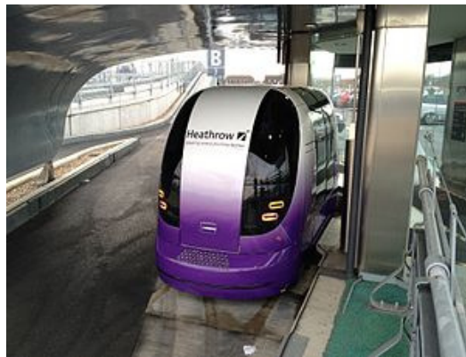
Figure 5: The UltraPod at London's Heathrow Terminal 5

There are clear signs on how the industry will evolve. First, there are ARVs which will be operated in restricted zones such as Eco-cities such as Masdar or Dongtan or in airports like the award-winning Personal Rapid Transit at London Heathrow Airport Terminal 5.